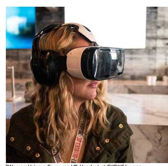
"Woman Using a Samsung VR Headset at SXSW" by nan palmero licensed under CC BY 2.0, https://creativecommons. org/licenses/by/2.0/

As a result, low bono practice opens the door to an entire sector of the economy and society with whom private attorneys have not previously engaged.