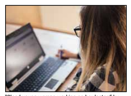
"Blond young woman working on her laptop"

Experienced attorneys and LLLTs know clients rarely provide all the important facts in the first call or email. Scheduling a 60- to 90-minute consultation can go a long way towards ensuring the