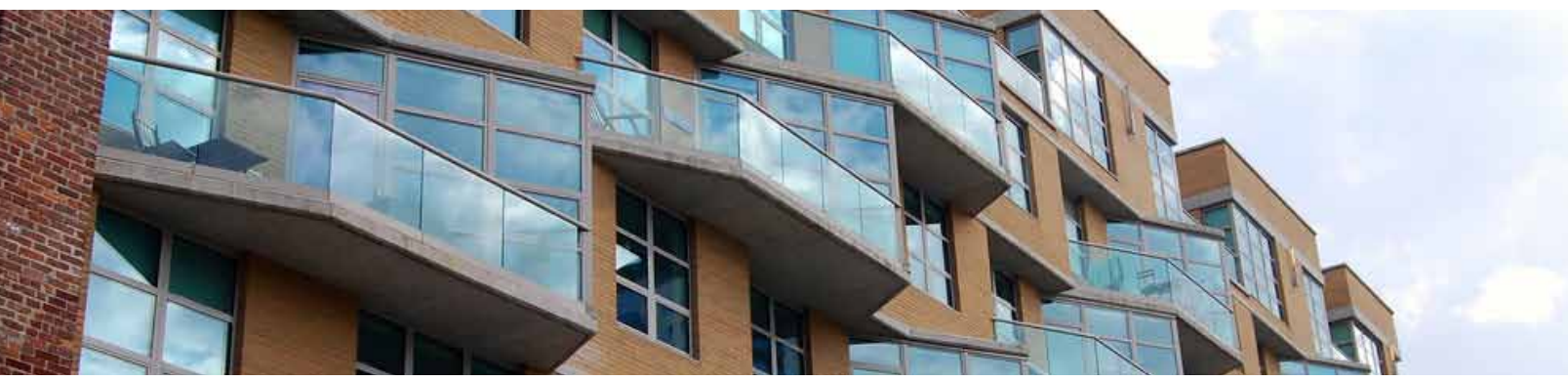
"Modern Building"

The Incubator Program is another step in the right direction. The