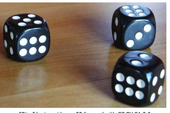
"Dice" by jacqui.brown33 licensed with CC BY-SA 2.0, https://creativecommons.org/licenses/by-sa/2.0/

For those of you not living under a rock, I am sure I don't have to explain that the United States economy is currently having a pretty rough go of it. Unemployment has skyrocketed, businesses are going bankrupt and quite a few legal practitioners are experiencing a substantive drop in their billable hours as a consequence of the COVID-19 pandemic. At present, both employers and consumers alike are struggling to find stable footing in the face of a rapidly