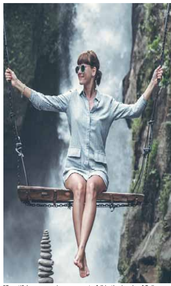
"Beautiful woman swings near waterfall in the jungle of Bali island, Indonesia."

Frank H. Knight established the economic definition of risk and uncertainty in his 1921 book, appropriately named, Risk , Uncertainty and Profit . In that book Mr. Knight stated "risk is present when future events occur with measurable probability." By comparison, he wrote "uncertainty is present when the likelihood of future events is indefinite or incalculable." In other words, risk is measurable and quantifiable, while uncertainty is just that ... uncertain.