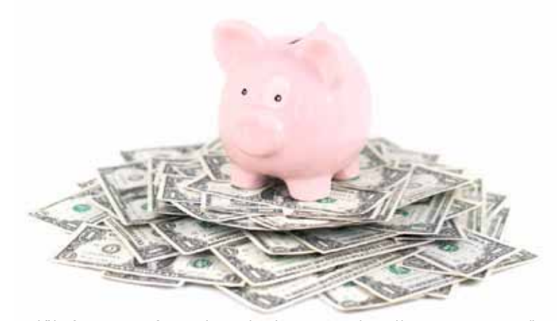
"Piggy Bank" by free pictures of money licensed under CC BY 2.0, https://creativecommons.org/licenses/by/2.0/

Historically, consumers will incur an expense when levels of risk can be approximated, and investments can