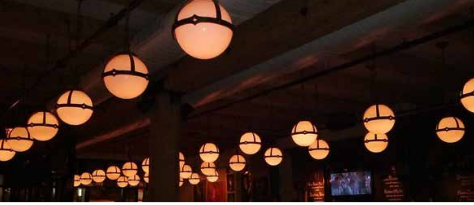
"The Party Lights" by Vicious Bits licensed under CC BY-NC-SA 2.0, https://creativecommons.org/licenses/by-nc-sa/2.0/