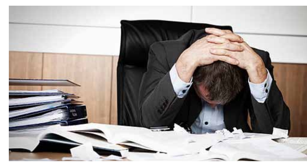
"Frustrated business person overloaded with work. - Credit to https://www.lyncconf.com/" \

But what does this have to do with implementing technology? Well, I suggest first looking at the processes in your firm that are least efficient. For example, does your firm require clients to download, print, sign, scan, and email back documents? Why? Many people do not own a printer, and especially