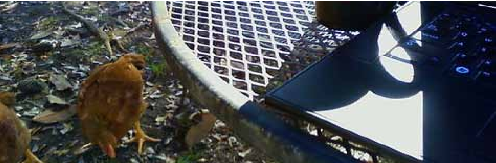
Working outside on a nice day."