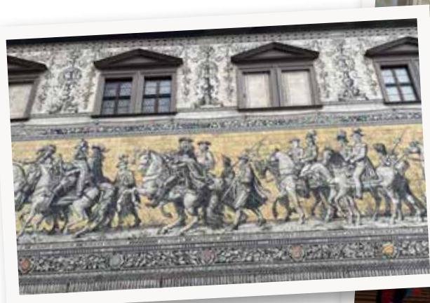
Parade of Nobles (Fürstenzug), Dresden. 24,000 Meissen porcelain tiles, fired 3 times at 2,400°F when created in 1907. Survived the 1945 Dresden bombing.

Dresden, a quaint town with an extraordinary porcelain glockenspiel