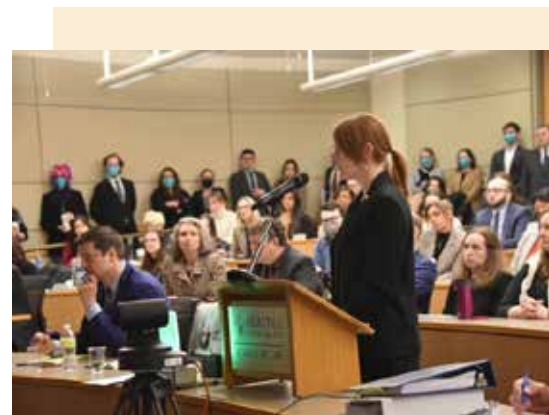
The Supreme Court holding a session at Seattle University

Finally, May will bring the court's In Memoriam service. On May 31, the court will honor the memory and