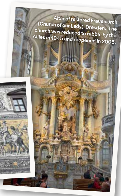
Altar of restored FrauenKirch (Church of our Lady), Dresden. The church was reduced to rubble by the Allies in 1945 and reopened in 2005.